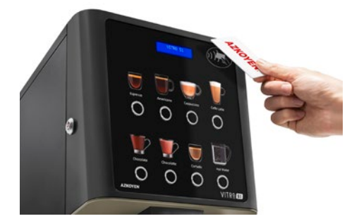
RFID Reader Kit For product recharge card or cashless systems